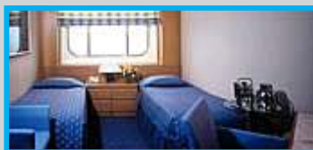
Ocean View(Fully Booked)